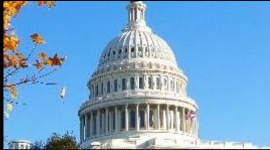
Government & infrastructure