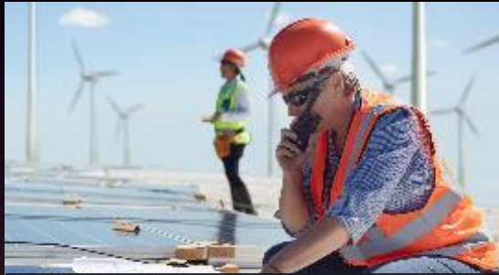
Industries & Energy