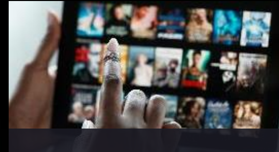
Technology, media & Telecommunications