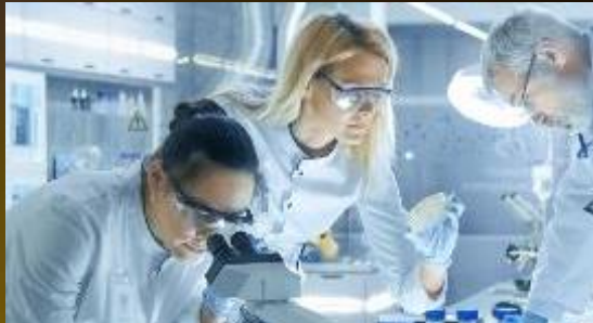
Consumer & Health